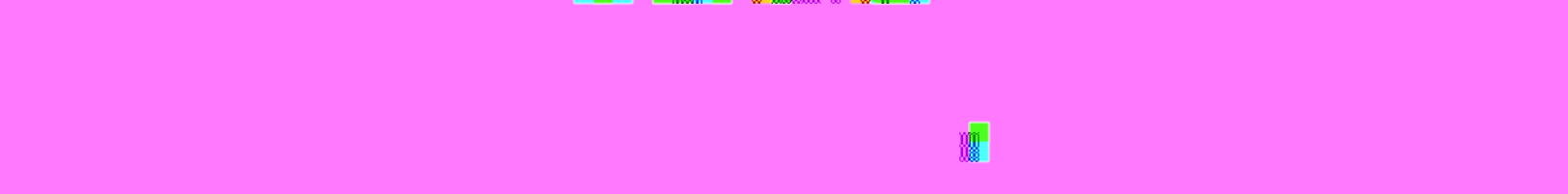
Exhibit F, Go Away Gray.com "FAQ" page